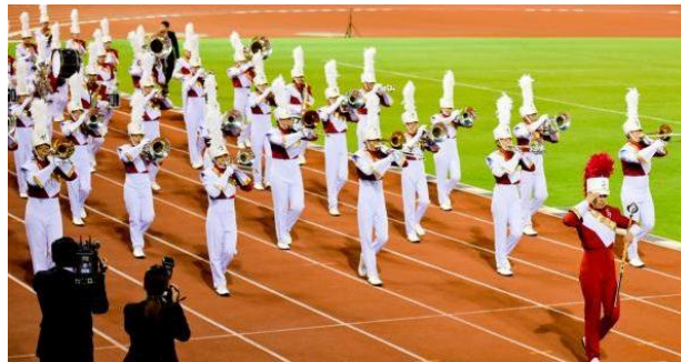
Figure 1. Marching Band Contest (Suanmontha)