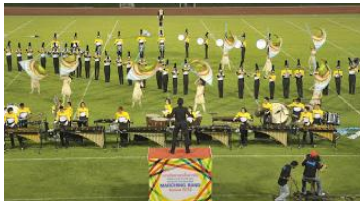
Figure 2. The parade procession transformation contest (Suanmontha)